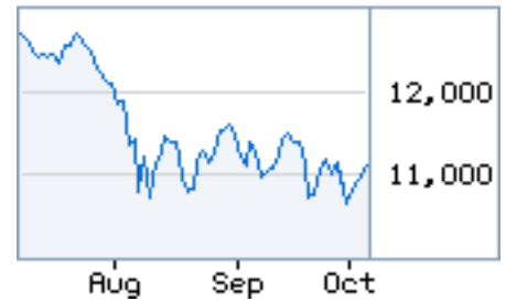
as of 4:05 PM ET 10/07/11

Admittedly, most of the plans I have worked on have been to respond to disruptive events: earthquakes, power outages, floods, etc. But now I have begun to wonder where the line is that separates continuity planning and business planning; or if one really exists? I have seen a slow "jobless" economic recovery drive many companies out of business. Gone are Linens N Things, Circuit City, and Borders. These large companies didn't fail as a result of a single catastrophic event, but rather succumbed to weakness in their customer base and a growing cost of business.