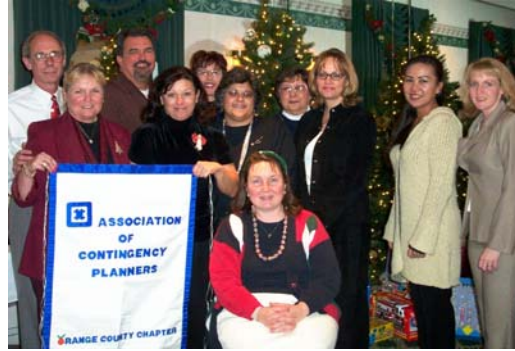
ACP-OC 2002 Board Members