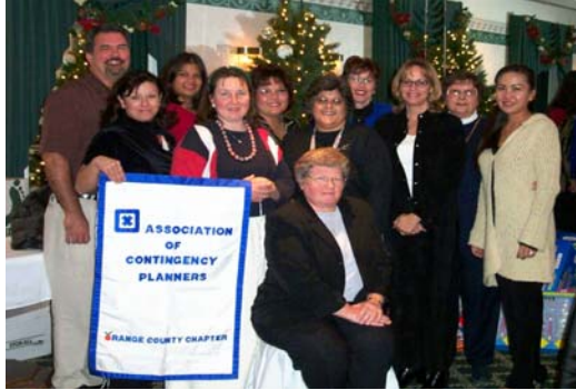
ACP-OC 2001 Board Members