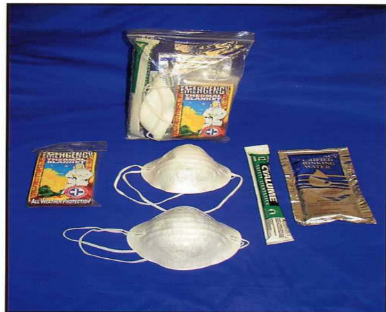
Contents pictured is the original kit used in the World Trade Center.

SIMPLER LIFE EMERGENCY PROVISIONS INC. P.O. Box 700704 San Jose, CA 95170-0704 (408) 973-1222 • FAX (408) 973-0470